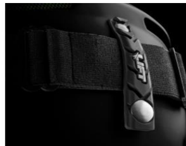
Snap Lock Strap