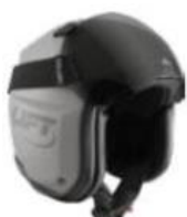
Matte Dark Grey