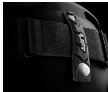
Snap Lock Strap